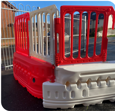
Connected at over 280° angular movement

With filling points on both sides, it allows a safe and rapid filling process, and a removable bung at the base facilitates easy emptying. This sturdy barricade is highly visible, providing effective guidance and control of vehicular movement while ensuring the safety of both pedestrians and drivers.