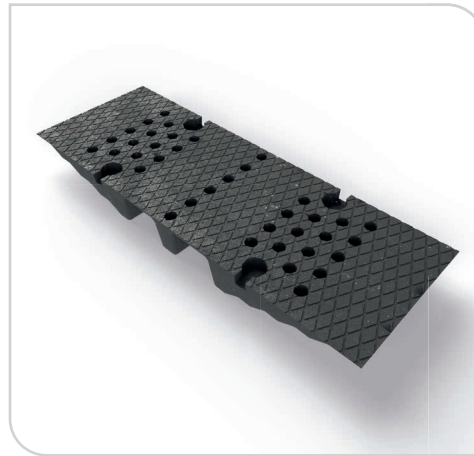
Underside of the ramp