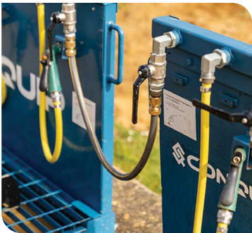
Close up of Water Supply Tap