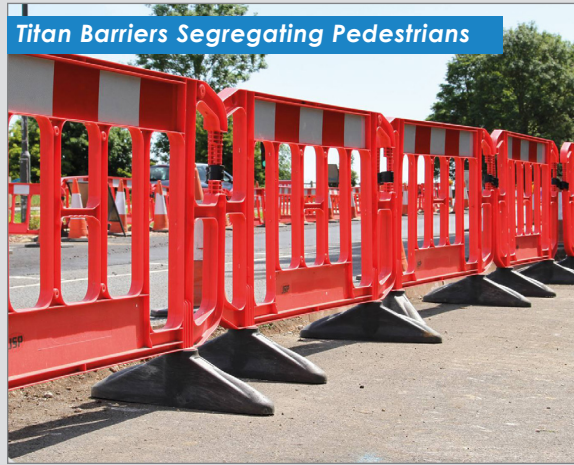
Titan Barriers Segregating Pedestrians