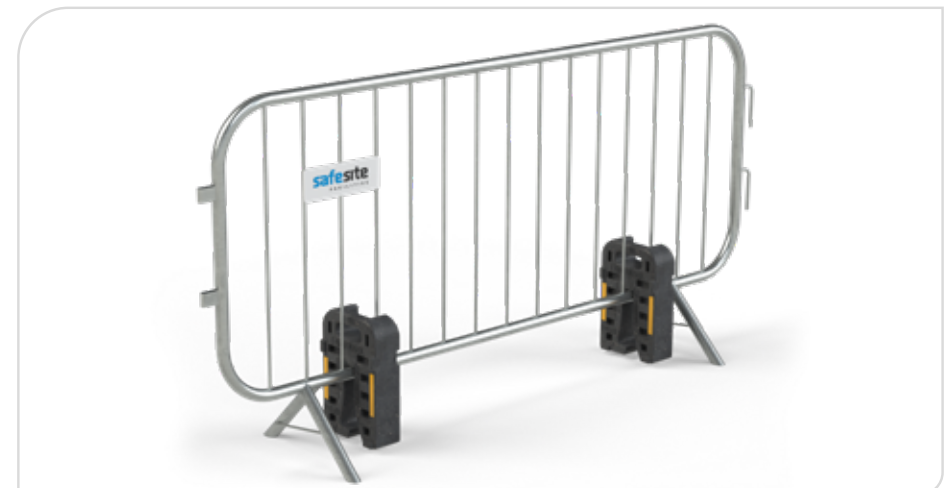
2x ballast blocks in use on a Pedestrian Barrier