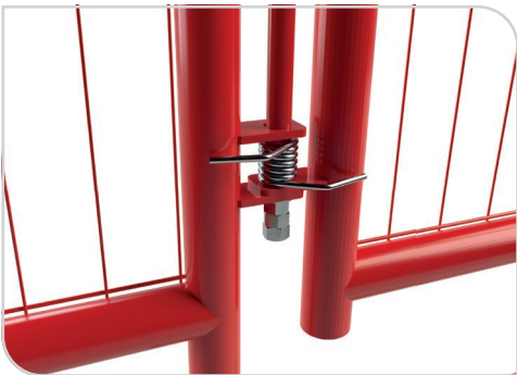
Replaceable Spring mechanism

This pedestrian access solution is perfectly suited for construction sites, combining robust durability with practical design. Its fully galvanised frame, finished in high-visibility red powder coating, offers superior resistance to corrosion, and harsh weather conditions. Designed for compatibility with RB22 Crash Barriers, it ensures secure and seamless integration into existing site safety systems. The addition of a rubber dampening pad helps minimise vibration and noise, enhancing longevity and durability. A simple, replaceable spring mechanism further supports low-maintenance operation and long-term reliability.