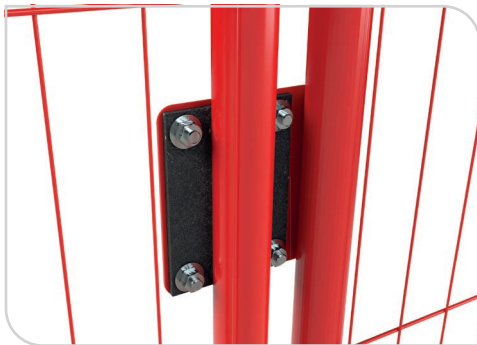
Rubber dampening pad