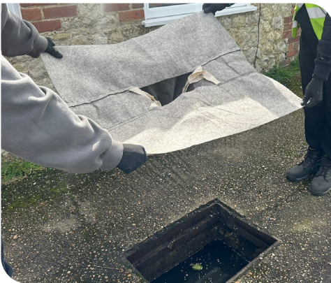
Site workers preparing Drain Guard