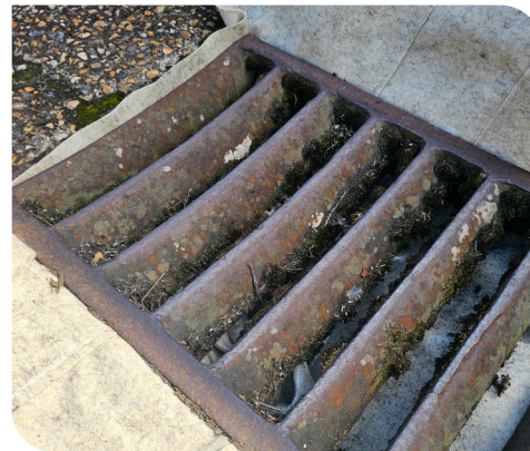
Drain Guard Installed