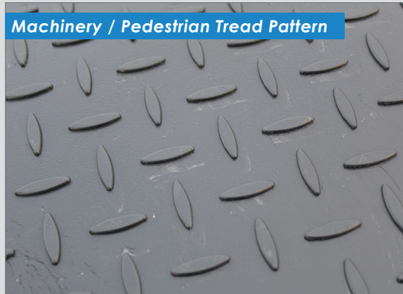
Machinery / Pedestrian Tread Pattern