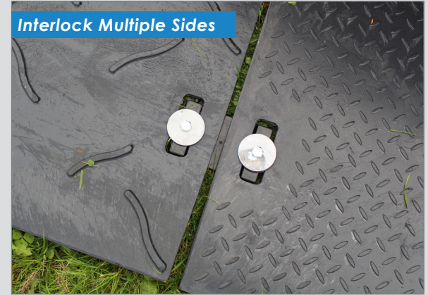
Interlock Multiple Sides