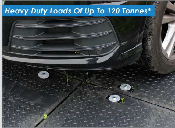
Heavy Duty Loads Of Up To 120 Tonnes*