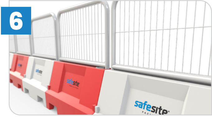
Repeat the same process for the rest of the barriers.