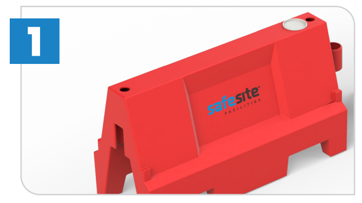
Place the barriers along the perimeter line you are creating. All the barriers should face the same direction

The Evo 55 barrier system comes in lengths of 1m and 1.5m. The system is simple and easy to install and requires no tools or additional accessories – just water!