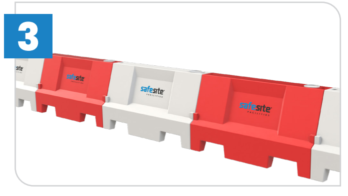
The barriers should fit together snugly without any gaps. Repeat this process with other barriers needed.