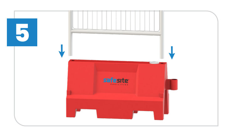
Slot the mesh fence panels, post and rail or reflect panels into the holes at either end of the barriers.