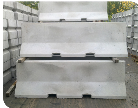
Concrete Jersey Barriers stacked