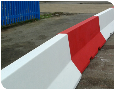
Unique interlocking system