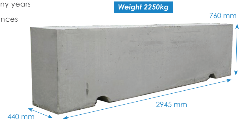
Heavy Duty & Difficult For Intruders To Move