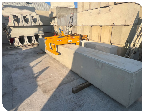
6m concrete barrier being lifted with crane