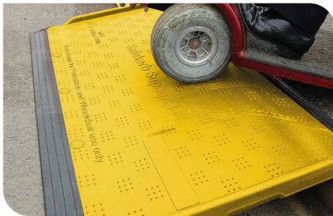
Suitable for use with mobility scooters over the Supagrip wheelchair ramp.