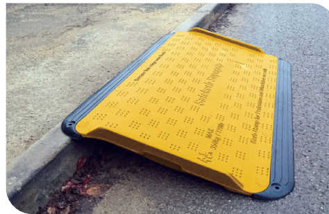
Supagrip Wheelchair ramp in situ on kerb