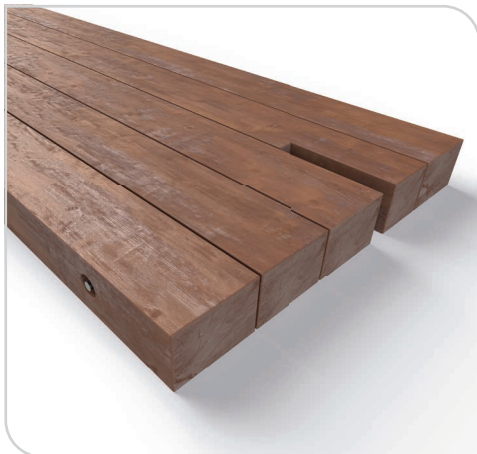
Close up of timber