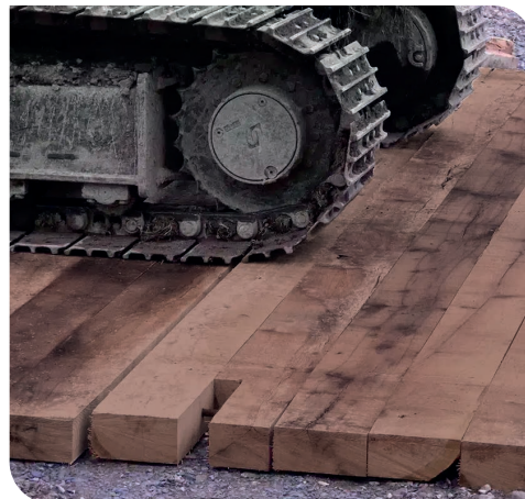
Can be use with plant machinery