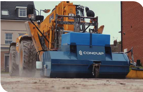
Powerbrush Sweeper in use

You can choose between the Standard model with drip-fed water or the Pressurised Water Spray model, which is ideal for especially dusty sites. Both versions can also be fitted with an optional kerb brush, making them perfect for cleaning along kerbs and gullies.