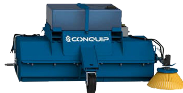
Standard/Pressurised Water Spray + Kerb Brush (Additional costs apply)