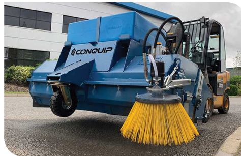
Powerbrush Sweeper with additional kerb brush attachment