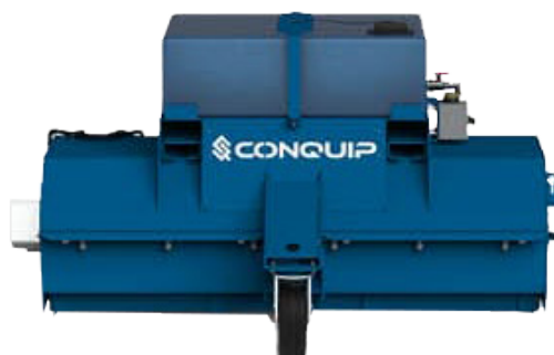
Pressurised Water Spray