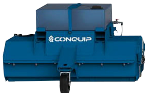
Standard – Drip Feed

You can choose between the Standard model with drip-fed water or the Pressurised Water Spray model, which is ideal for especially dusty sites. Both versions can also be fitted with an optional kerb brush, making them perfect for cleaning along kerbs and gullies.