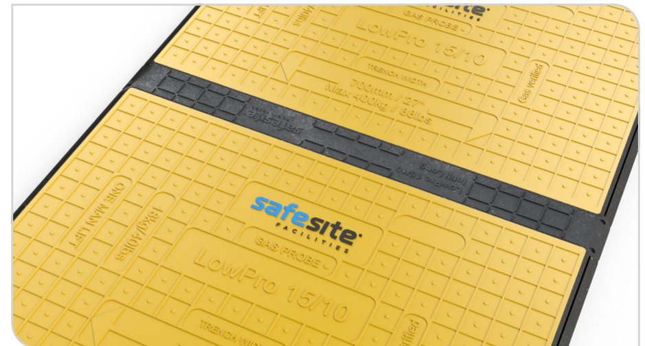
Long Infill strips connected with LowPro 15x10 Trench Cover