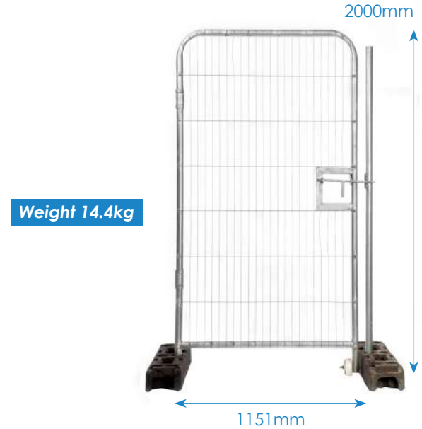
Pedestrian Gate Connected To Heras Fencing