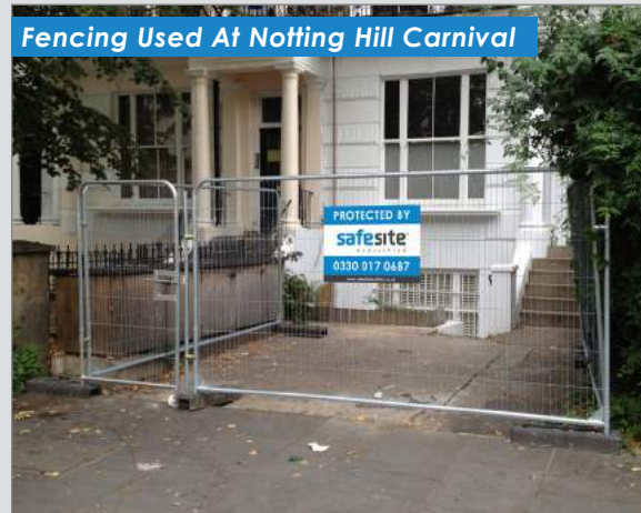
Fencing Used At Notting Hill Carnival