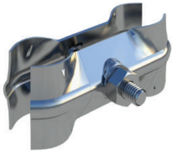
Qty 4: Coupler