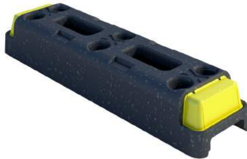
Qty Min 2: Hi-Vis Thermo-Plastic Feet