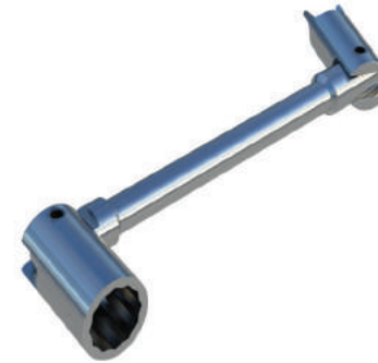
Qty 1: Spanner