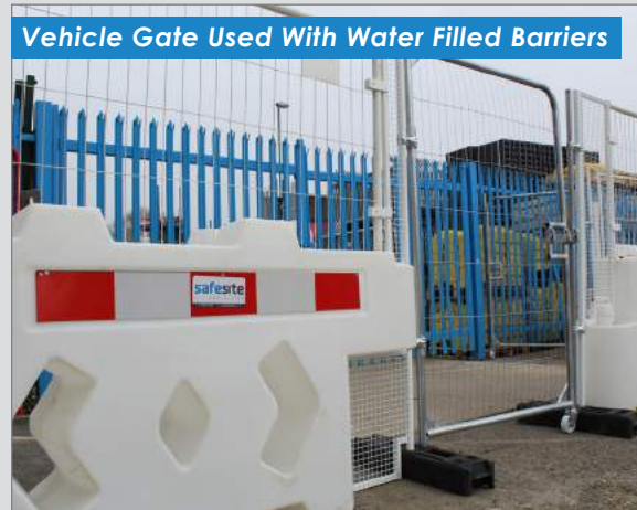
Vehicle Gate Used With Water Filled Barriers