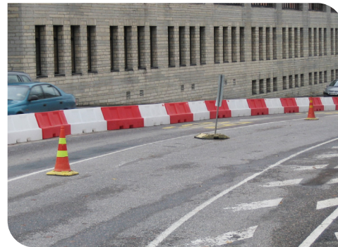
Euro 2m Barrier in situ