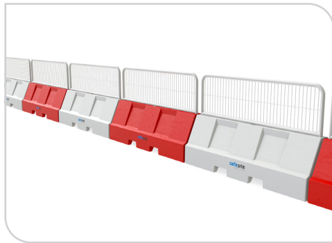
Euro 2m Barrier with Mesh Fencing

These heavy ballasted, stabilised prime polyethylene Euro 2m Road Barriers comprise a simple interlocking-pin design, allowing easy and gap-less pivoting around corners and turns.