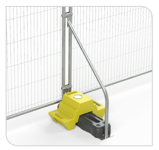
Hi-vis concrete ballast block

The blocks weigh an impress 44kg and add stability by being position over the standard foot. The plastic cover/finish means that the ballast blocks are resistant to all types of weather and easy to maintain.