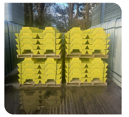
Ballast blocks stacked - 24 per pallet