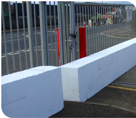
4m concrete barriers blocking entrance