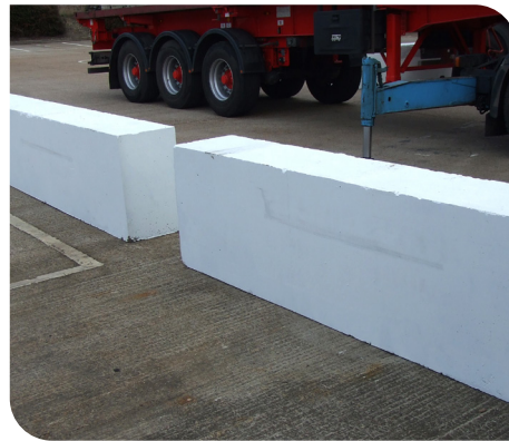
Offloading of 4m concrete barrier