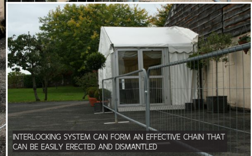
INTERLOCKING SYSTEM CAN FORM AN EFFECTIVE CHAIN THAT CAN BE EASILY ERECTED AND DISMANTLED