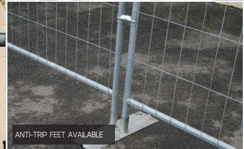
ANTI-TRIP FEET AVAILABLE