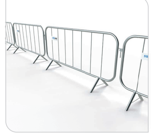
Features Fixed Feet