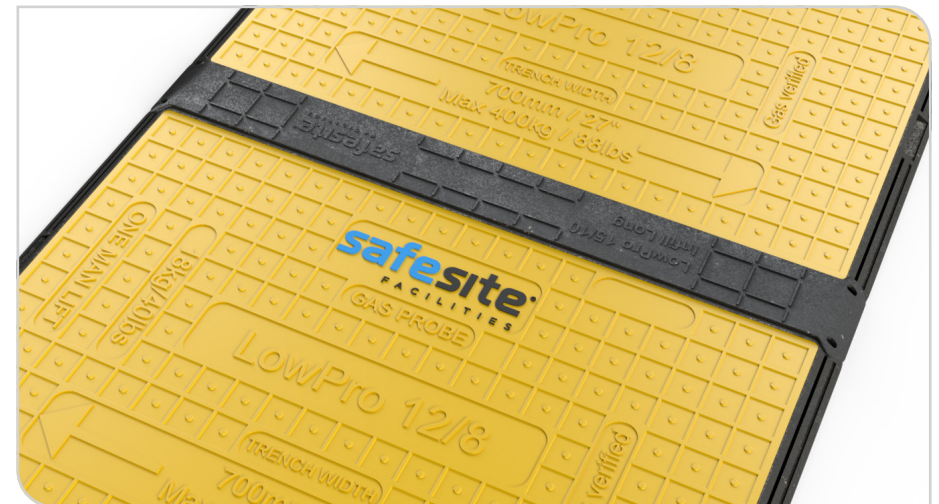
Long Infill strips connected with LowPro 12x8 Trench Cover