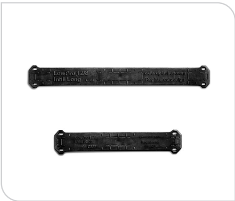
Can use Infill strips between trench covers for connecting a seamless path

The covers can be quickly installed, and the black rubber edges grip the asphalt – negating the need for bolts. The LowPro 12/8 trench cover measures 1.2m x 0.8m and can be connected to additional LowPro covers using the infill strips.