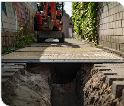
Can create temporary or semi-permanent road covers