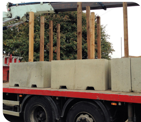
3m concrete barrier on vehicle