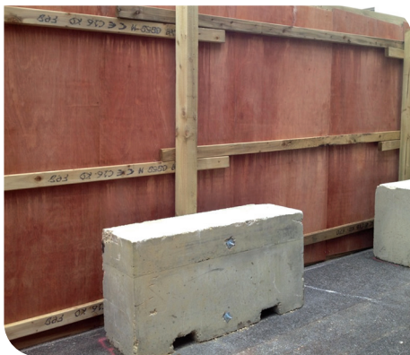
3m concrete barriers in situ as timber hoarding ballast