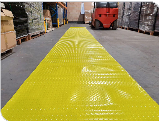
The perfect for walkways in construction sites, warehouses and factories or any high-traffic area.