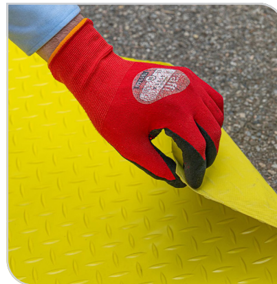
Diamond Grip Pattern