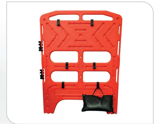
Hooks for hanging extra ballast