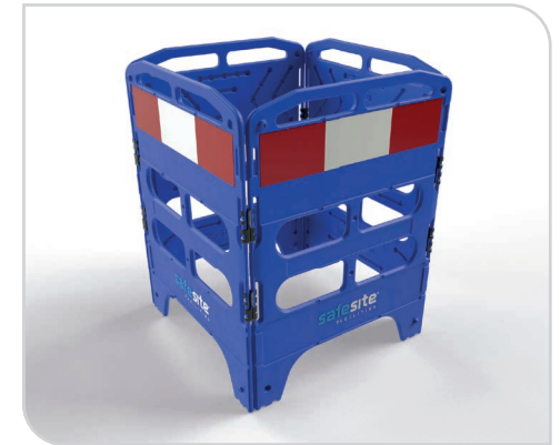
Available in blue & other colours