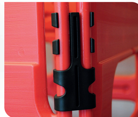
Stable and strong corner hinges