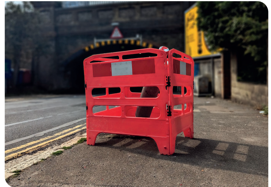
Four sided 1000mm Utility barrier in use