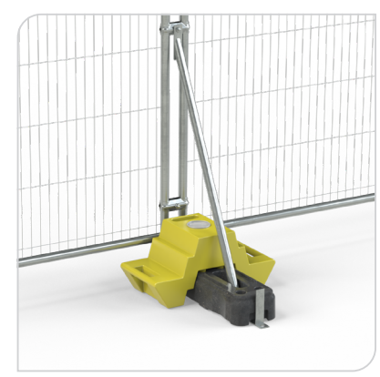
TFS100780 - Short Stabaliser