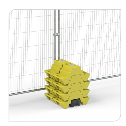
TFS100605 - Single Foot No Stabaliser