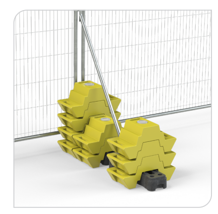
TFS100605 - Standard Stabaliser Double Foot