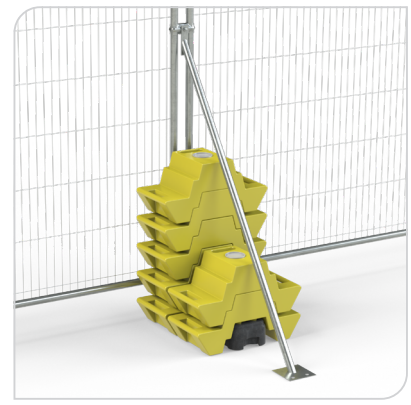
TFS100740 - Standard Stabaliser