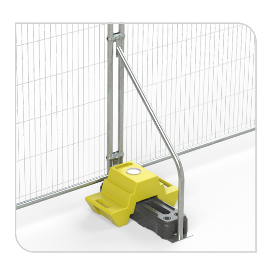
Hi-vis concrete ballast block

The blocks weigh an impress 44kg and add stability by being position over the standard foot. The plastic cover/finish means that the ballast blocks are resistant to all types of weather and easy to maintain.