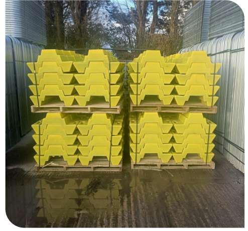
Ballast blocks stacked