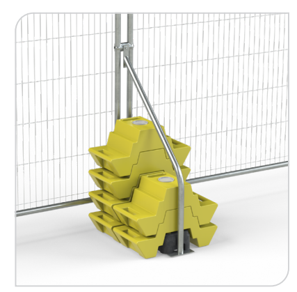
TFS100700 - Angled Stabaliser